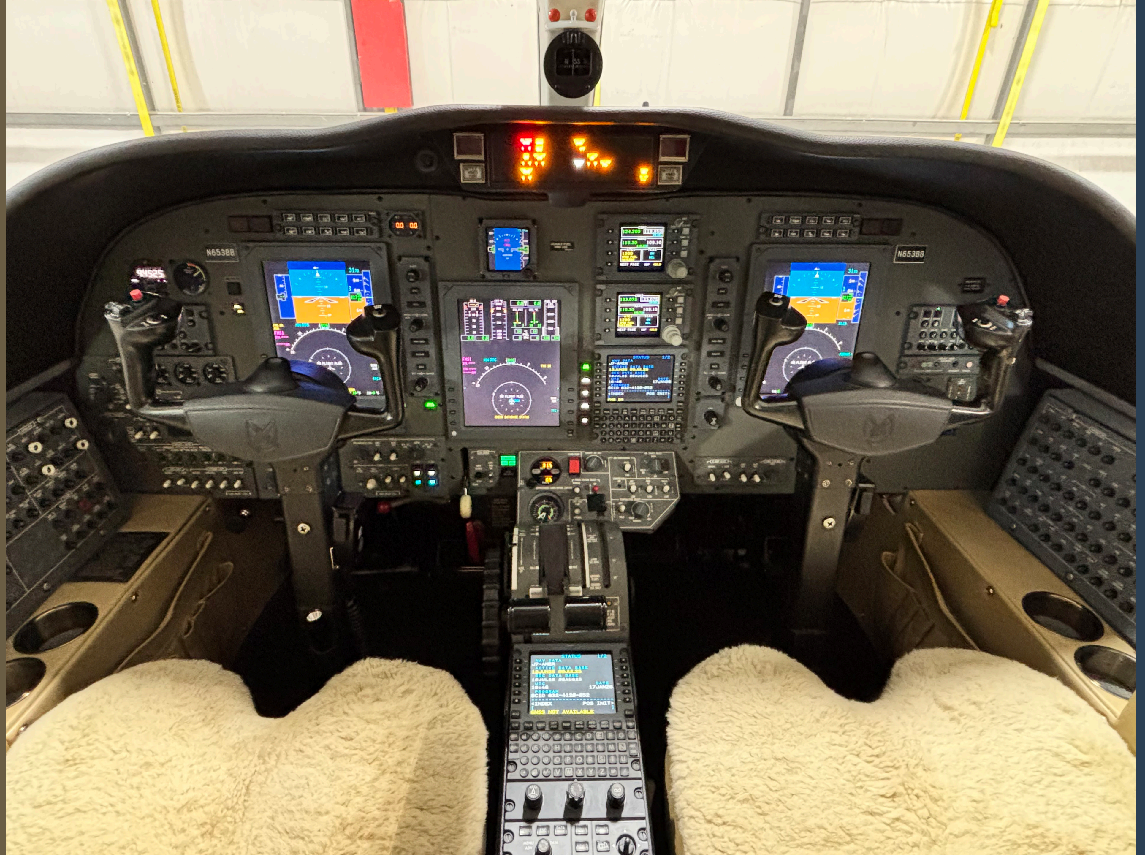
2008 CESSNA CITATION CJ2+ N653BB 525A-0381